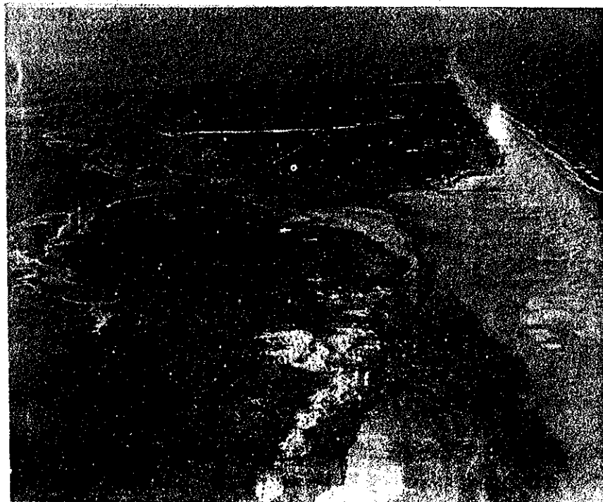
Figure IV : Cedar Bayou April 1, 1959, just prior to dredging and straightening of the channel.