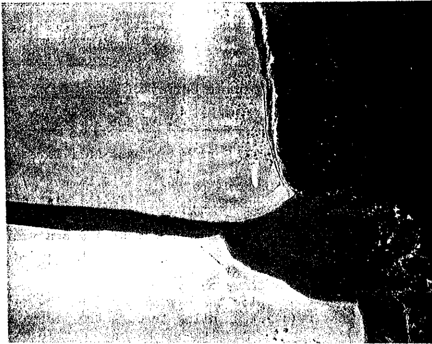
Figure III : Gulf entrance of Mansfield Cut August 8, 1959. The sinking jetties can be seen in the surf zone.