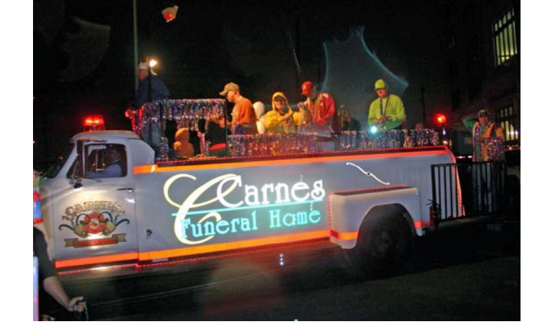
This parade had some unusual entries. I have never seen a funeral home float.

Aquarius started at 6:45pm and luckily got through most of the lineup before it rained on our parade.