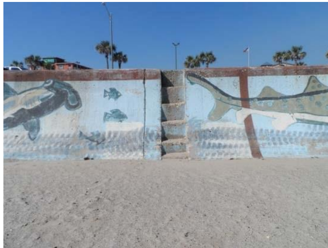
Fig. 3: Example of an embedded staircase on the Seawall