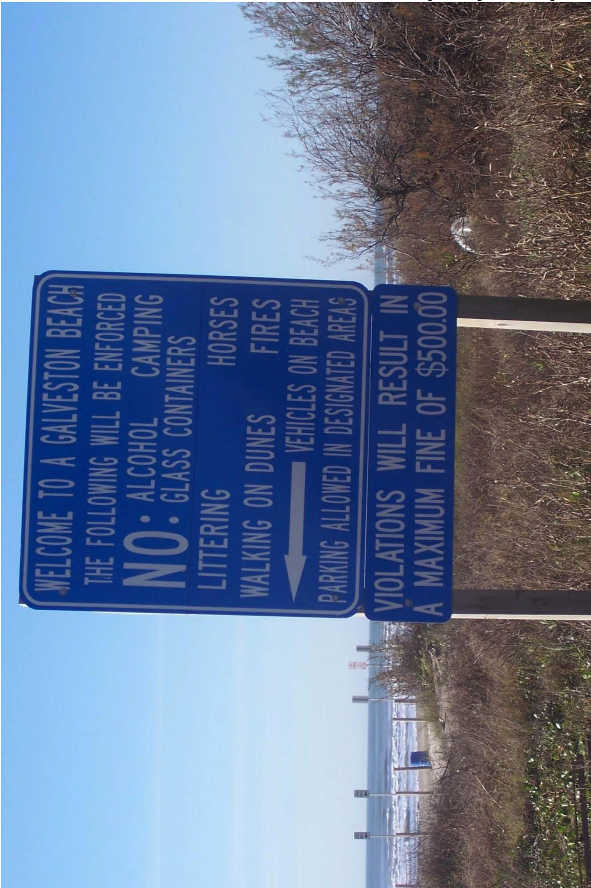
Annex 3: Existing Sign in West End On-Beach Parking Areas