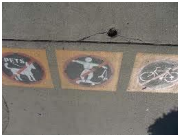
Fig. 1: Example of painted sidewalk regulatory signage

Figure 1 shows an example of painted regulatory signage similar to that which would be implemented on the Seawall.