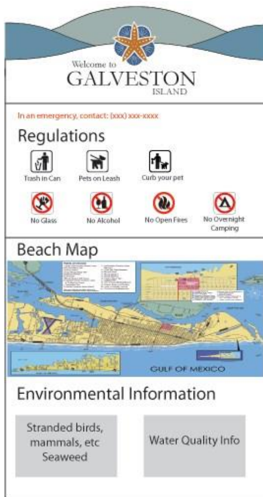
Fig. 2: Approximate layout signage, with divided into 3 main components

These will be single-sided, in Beach Park Sign style, and have dimensions of 3' x 5'. The three main components of the signs will be regulations, a beach map, and local environmental information that includes water quality. Figure 2 shows a representation of the sign's content.