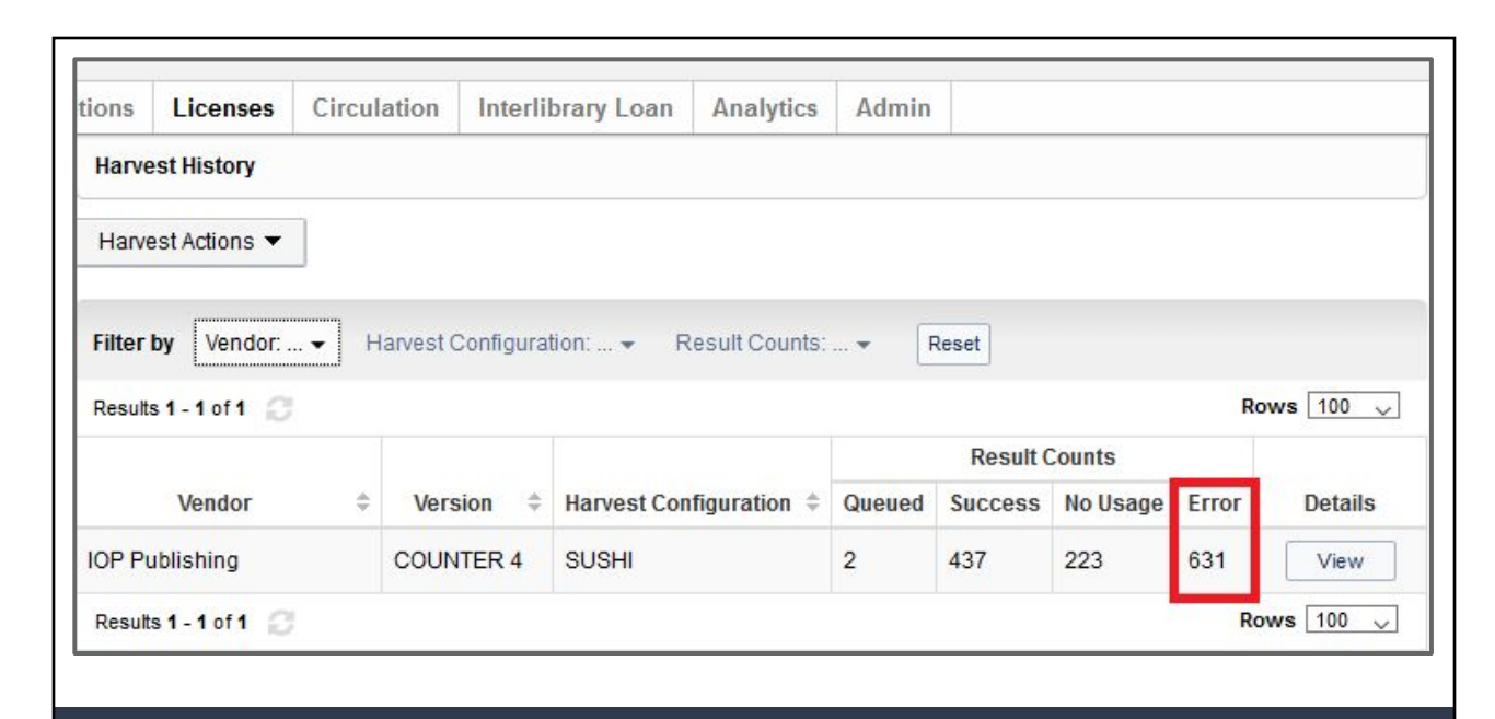
That's a lot of errors.