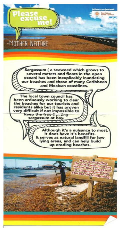
Sargassum flyer produced in Belize.

An important first step is to ensure coastal users and other stakeholders, including the general public, receive relevant and reliable information about sargassum and the periodic influxes in the region, as well as the on-going management efforts. Various communication methods can be employed such as public announcements, signs on beaches, distribution of fact sheets, brochures, infographics, a telephone hotline, documentary films and traditional (e.g. radio) as well as popular social media platforms. A good place to share information and learn from experiences across the region is the online forum set up for this purpose