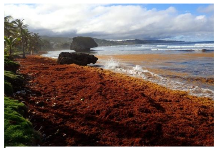
Mass stranding of sargassum on beach at Bathsheba, Barbados.

information on the recent 'sargassum influxes' (arrival of unprecedented mass quantities of sargassum seaweed) in the Caribbean region; and, importantly, by offering guidance on how best to <u>sustainably</u> manage the seaweed, based on lessons learnt to date. This first brief focuses on the immediate problem of clean-up, after mass strandings of the weed. Others will be developed that focus on potential commercial uses of the weed