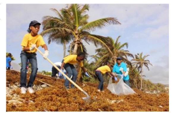
Beach clean-up with volunteers, Bathsheba, Barbados.

Where the volume of sargassum is relatively small, manual removal (e.g. hand raking) is preferable