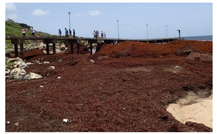
Inundation of Skeetes Bay, Barbados with sargassum.

Observations from the Sargasso Sea indicate that free-floating sargassum circulates seasonally between the Gulf of Mexico and North Atlantic, and exhibits considerable inter-annual variation in biomass of the seaweed and in frequency and volume of shoreline strandings. This year to