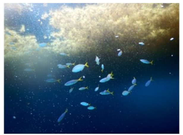
Floating sargassum with associated pelagic fishes.

Sargassum is a brown marine alga (seaweed) which is generally associated with the Sargasso Sea of the North Atlantic Ocean. It is made up of leafy appendages, branches and round, berry-like structures. These "berries" are actually gas-filled structures (mostly oxygen) which aid in buoyancy, allowing the sargassum to float on the