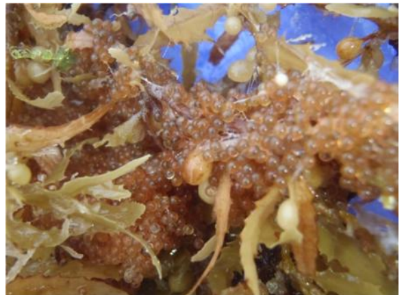
Flyingfish eggs on sargassum.

habitats for a diversity of marine species. These sargassum rafts provide refuge and food for over 250 species of fish and marine invertebrates, some of which are not found anywhere else (e.g. the iconic sargassum anglerfish). The rafts serve as important feeding grounds for migratory and commercially important species such as dolphinfish and tuna; act as spawning areas for flyingfish and eels; and as nursery grounds for endangered sea turtles. In addition, various species of seabirds (e.g. terns and boobies) forage