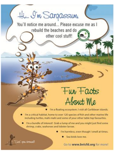
Example of poster in the British Virgin Islands.

by the UNEP-CEP Regional Activities Centre for SPAW