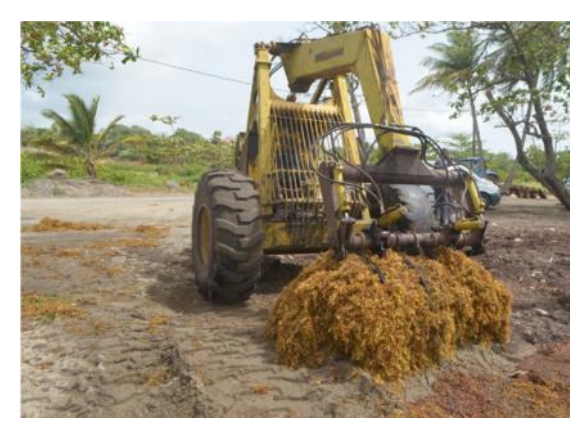
Using a cane-loader to collect large quantities of sargassum in Guadeloupe.

top and bottom layers of seaweed. In some countries a front-end loader with large load-bearing tyres has been used to remove the huge quantities. This has been effective when used to remove only the top layer without touching the sand and then a mechanised rake or manual removal is used to collect the rest. In the French Antilles they have experimented successfully with using cane loaders to pick up large quantities of sargassum, prior to clearing with a mechanised beach rake.