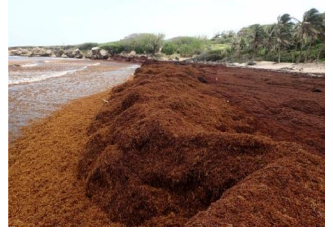
Barrier of sargassum along the shore of Skeetes Bay, Barbados.

inundations when sargassum piles up along the shorelines forming barriers several metres high, a combination of removal methods is likely to be required. In cases like this, the sargassum should be removed as soon as possible after arrival to avoid vast accumulations of the seaweed along the tideline which decomposes and serves to trap more weed in the water and form dark brown plumes nearshore. In such cases a multi-level approach will be needed, where different equipment is used to remove the