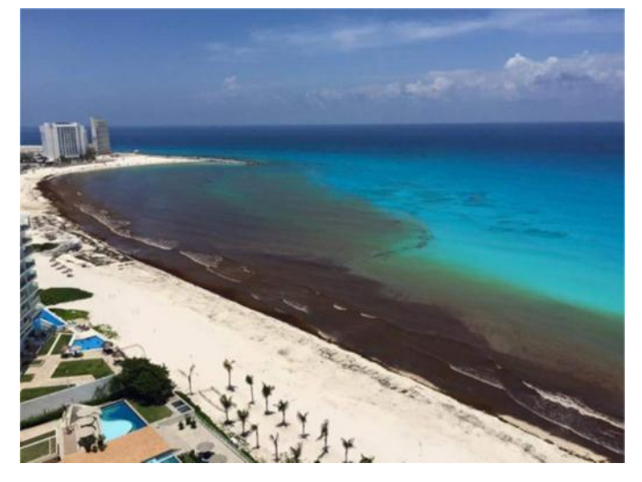
Mass influx of sargassum decomposing near shore and producing a dark brown plume

poisonous hydrogen sulphide gas, which smells awful and is harmful to most marine animals. Prolonged exposure to high concentrations of hydrogen sulphide gas can also cause human health problems (including nausea, headaches, skin rash and even breathing difficulties) and can tarnish metals (coins, bathroom fittings, door knobs, even jewellery etc.) as well as damage sensitive electronic appliances (TVs, computers, air-conditioning units). As a result, insurance companies in the French Antilles are now covering losses