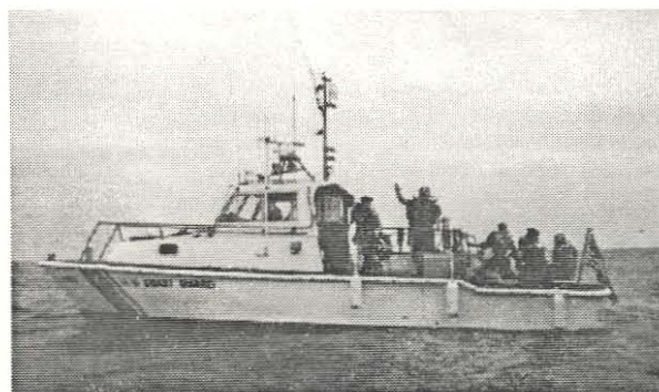
"One of several boatloads of Society members leave for Grande Terre".