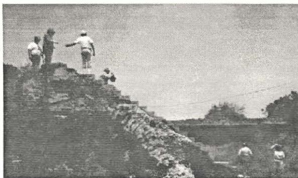
"Members climb down stairs from atop Ft. Livingston to the old parade grounds".